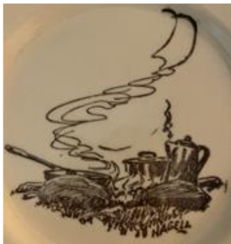
Campfire motif on a ceramic plate (see page 9)